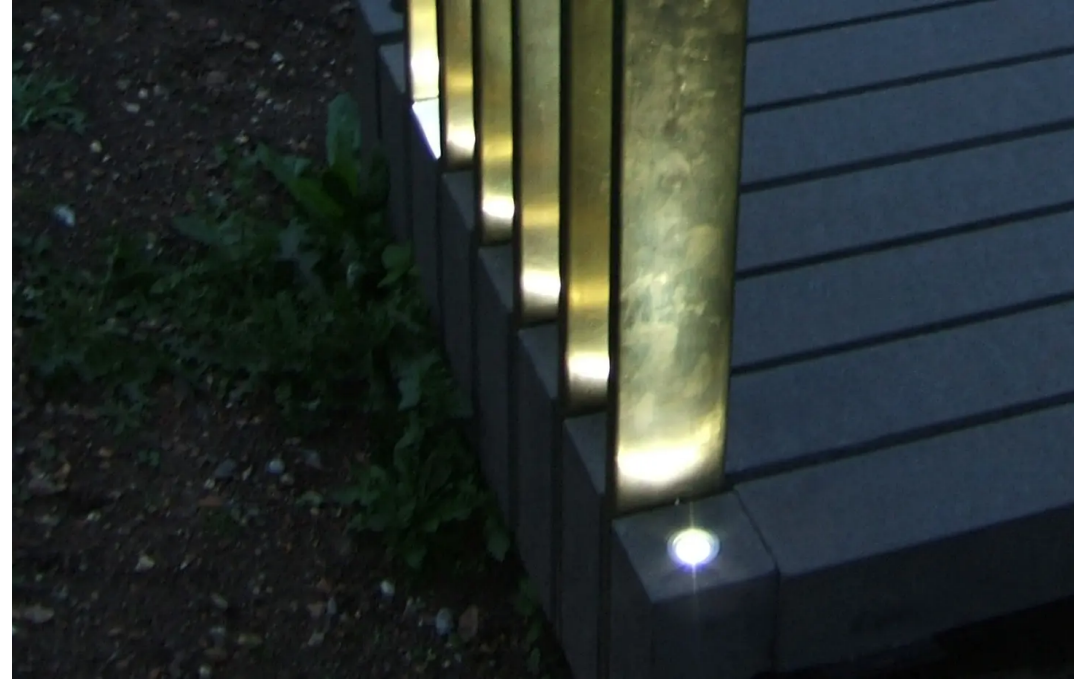
Testing integrated lighting details